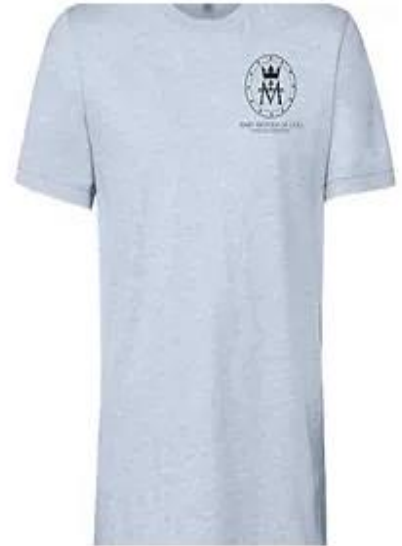
Mary Mother of God 2023 From $15.00