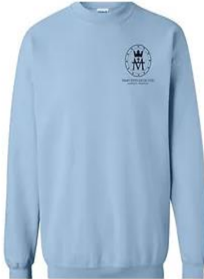
Mary Mother of God 2023 Pullover From $20.00