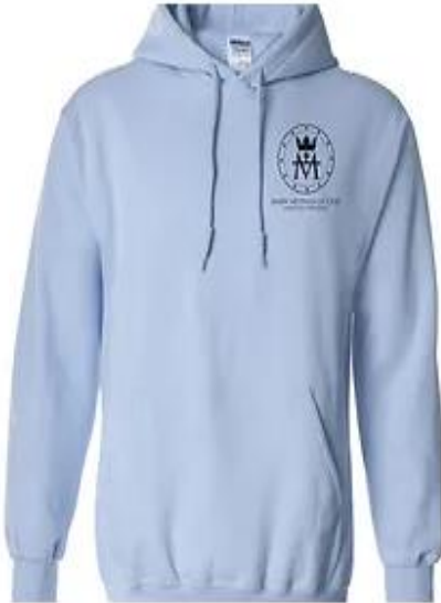
Mary Mother of God 2023 - Hoodie From $25.00