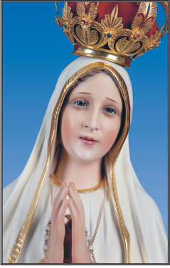
Our Lady of Fatima